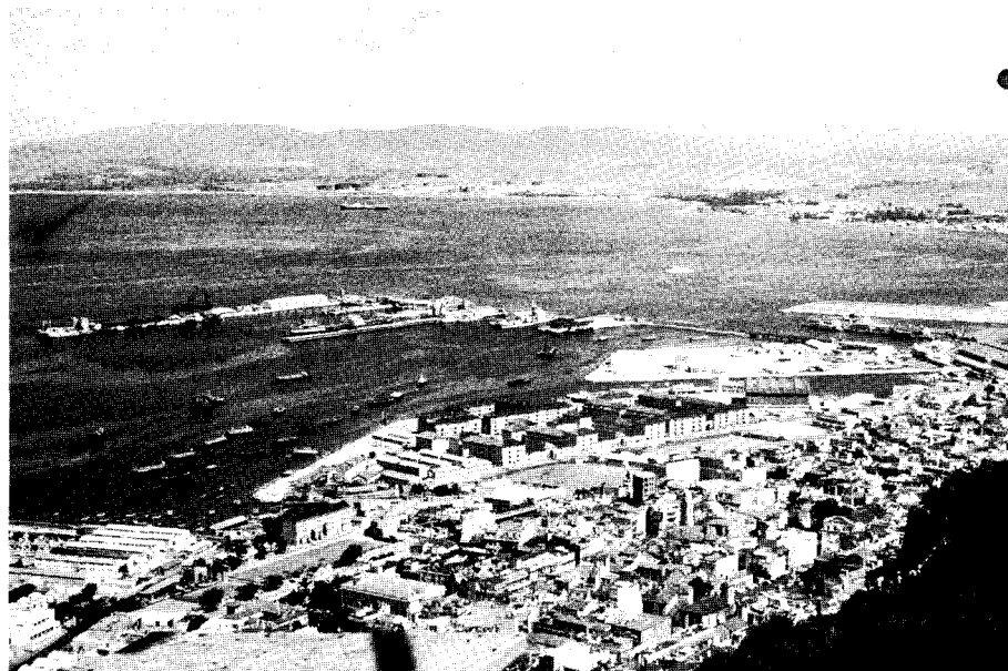
Ambassador College Photo

Below, Port of Gibraltar, part of stronghold complex built by the British.